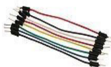
Figure 5. Jump Wires.