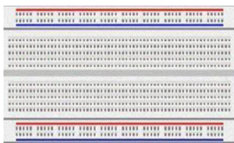
Figure 4. Bread board.

A modern solderless breadboard consists of a perforated block of plastic with numerous tin plated phosphor bronze or nickel silver alloy spring clips under the perforations. The clips are often called tie points or contact points. The number of tie points is often given in the specification of the breadboard. The spacing between the clips (lead pitch) is typically 0.1 in (2.54 mm). Integrated circuits (ICs) in dual in-line packages (DIPs) can be inserted to straddle the centerline of the block. Interconnecting wires and the leads of discrete components (such as capacitors, resistors, and inductors) can be inserted into the remaining free holes to complete the circuit. Where ICs are not used, discrete components and connecting wires may use any of the holes. A breadboard is utilized to build and test circuits expeditiously afore finalizing any circuit design. The breadboard has many apertures into which route components like ICs and resistors can be connected.. A typical breadboard that includes top and bottom power distribution rails is shown below figure 4. Jump wires are generally used to establish connectivity with bread board as shown in figure 5.