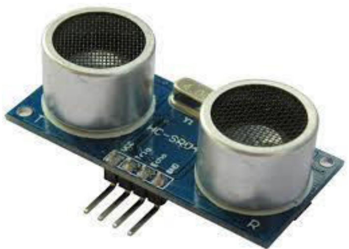
Figure 3. Ultrasonic Sensor.

the distance with high accuracy and stable readings. It can measure distance from 2cm to 400cm or from 1 inch to 13 feet. It emits an ultrasound wave at the frequency of 40KHz in the air and if the object will come in its way then it will bounce back to the sensor. By using that time which it takes to strike the object and comes back, you can calculate the distance. Distance can be measured by equation 1. Distance = Time * sound speed /2. (1) Where Time = the time between an ultrasonic wave is received and transmitted. It has four pins. Two are VCC and GND which will be connected to the 5V and the GND of the Arduino while the other two pins are Trig and Echo pins which will be connected to any digital pins of the Arduino. The trig pin will send the signal and the Echo pin will be used to receive the signal. To generate an ultrasound signal, you will have to make the Trig pin high for about 10us which will send a 8 cycle sonic burst at the speed of sound and after striking the object, it will be received by the Echo pin. Ultra sonic sensor as shown in figure 3. IOP Conf. Series: Materials Science and Engineering 263 (2017) 042027 doi:10.1088/1757-899X/263/4/042027